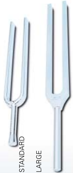
TUNING FORK Earth's day (synodic) 194,18 Hz

The large sized tuning forks are about 60% heavier than the standard forks. That's why they are vibrating a longer time after pushing it. For this reason they are proper for professional permanent usage. The stomps of the large forks are easier to hold for people with big hands.